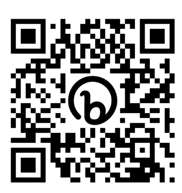
Visit the 2050 Webpage